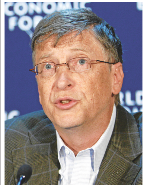
Microsoft co-founder Bill Gates officially declared on Twitter that Microsoft is ending work on Windows and switching focus to the exciting Windows phone project.

Friday, April 1 at 12:30 pm is the official time of death. Yes, that's right, Microsoft laid down in defeat, officially declaring that Apple is the winner of their long-standing fight for the soul of the world. Okay... maybe I'm exaggerating a little, but this is pretty huge!