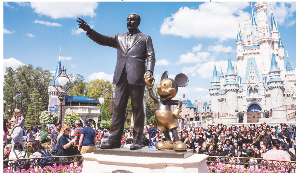
A trip to Florida is no longer necessary to get your Disney fix as company executives announce a new park to be built in NYC.

will be able to find the park's main attraction which will be centered around the 2007 Disney movie "Enchanted."