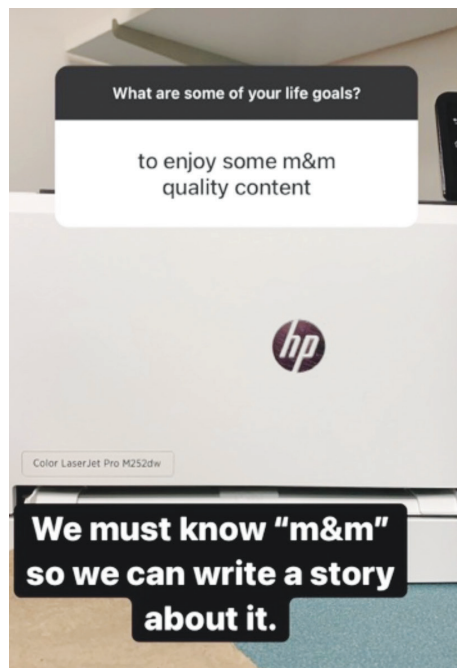
Screenshotted Delphian story continuing the mysterious M&M saga

two separate people, considering they each represent a different M&M. Now let’s limit it down to just our Delphian editors and writers. If both M’s are representing either a first or last name that begins with this letter, then we can limit it down even more.