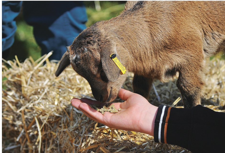
As stress levels increase, Adelphi's SCC developed a new initiative to lower stress levels campus-wide.

The petting zoo will alternate the animals in residence giving all animal lovers a