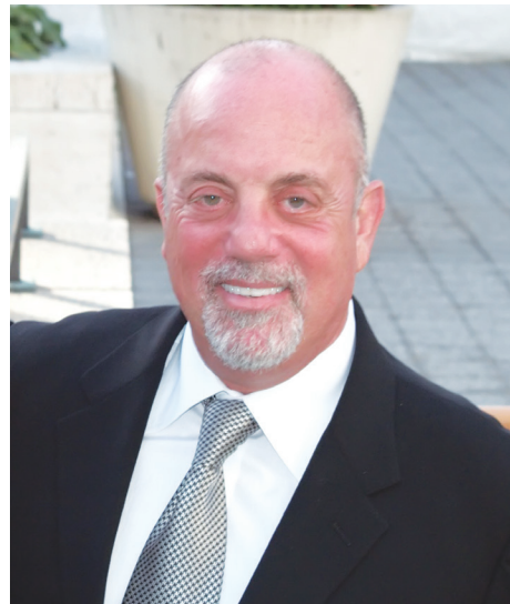
Billy Joel has sought legal action against Adelphi claiming the renovated University Center looks just like his album cover from "Glass Houses."

Right," the opening track that kicks off the album with a bang, to other signature songs like "All for Leyna," the LP, quite literally, rocks from beginning to end.