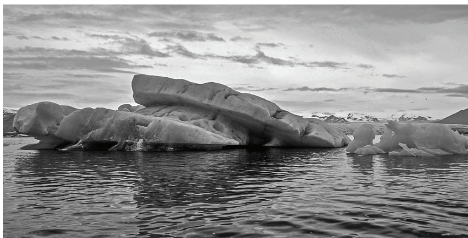
As the water temperature gets warmer, the icebergs on the North and South Poles have begun to melt.

I'm frightened for the future as we cannot change the damage that's already been done. It's a dog-eat-dog world and the only way that we can try and help our earth is by first acknowledging the damage that's been done already and finding a way to take better care of our home.