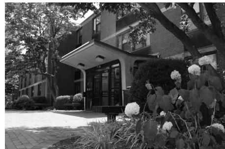
Within the past year, Adelphi has made significant changes to the way the residence halls on campus are staffed and run. Pictured is Eddy Hall, one of seven residence halls on campus where around 170 out of about 1,100 resident students reside.