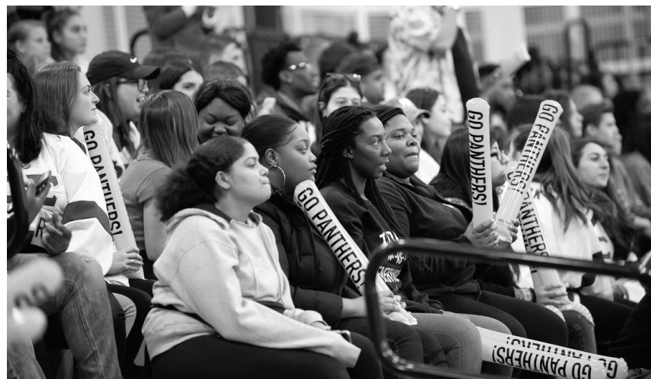
This picture from a game before the pandemic shows the Adelphi community cheering on their fellow peers. Now masked fans are welcome back in the stands.

Fans in the stands are vital to the sports world. Adelphi Athletics thrives on a field supported by a community consisting of students, faculty, staff and parents. Come join Adelphi athletes by cheering and supporting them at every game.