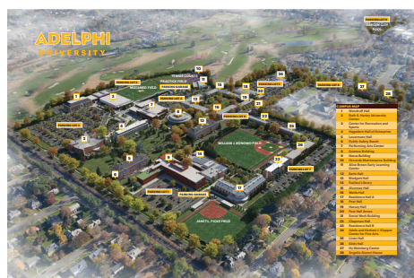
3D image of Adelphi campus found on the school website.

We hope this guide is a useful tool to help you navigate around campus. For more information, visit map.adelphi.edu , an interactive campus map that shows you all of the buildings on Adelphi and what they contain. In addition, download and print a physical copy of the Adelphi map at https://www.adelphi.edu/brand/design/assets-and-templates/campus-map/ . Stay on track, Panthers!