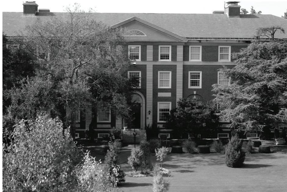
The Office of Community Concerns and Resolutions is located in Levermore Hall, Room 106.

"I will also be focusing on ensuring that policies are accessible and readable while also ensuring transparency and effective communication around our concern resolution processes," she said. "I will achieve this by visiting student organization meetings to hear about the students' experiences with and perceptions of Adelphi's