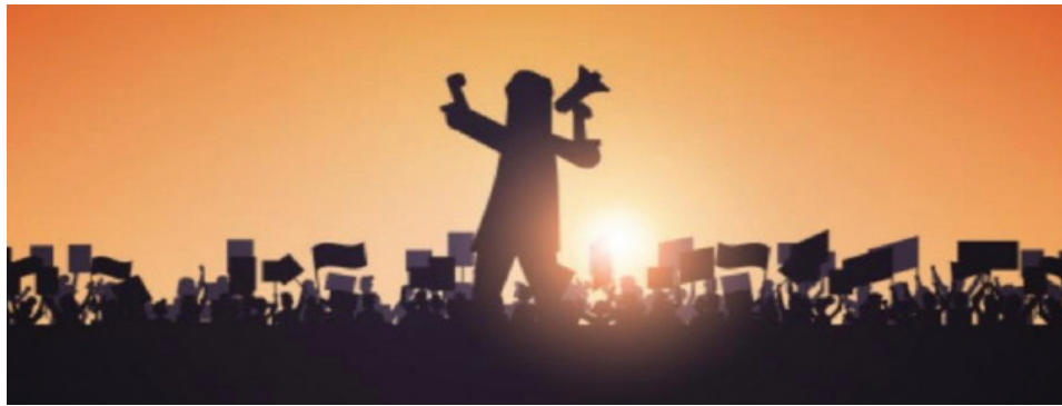
This photo was used on the promotional materials about the event.

Adelphi has a history of activism and it