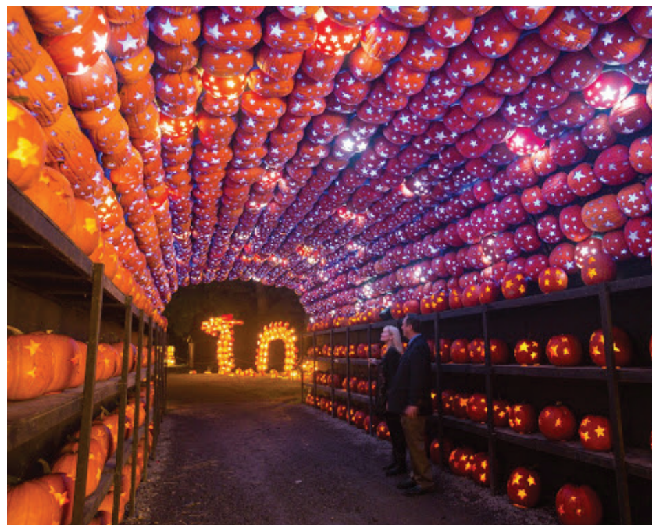
The Great Jack-O-Lantern Blaze is a walk-through experience with thousands of carved and lit pumpkins in many different designs, an exciting and safe experience for this Halloween.

With a few exceptions, Long Island has surely made it possible to enjoy this fall and this year's Halloween with plenty of events and outdoor activities to keep us entertained and occupied. While Covid may stop us from having a normal Halloween, it won't stop us from enjoying what's been given to us instead.