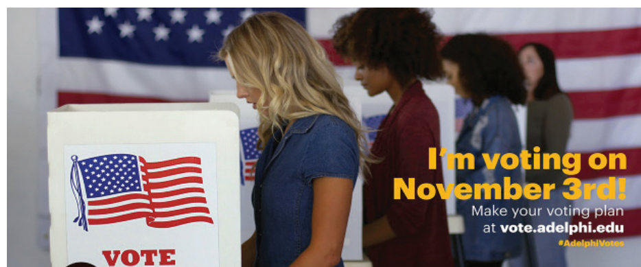
Get out and vote. There has never been a more important time to use our voices. This is a zoom virtual background available to all members of the Adelphi community on the adelphi.edu website.