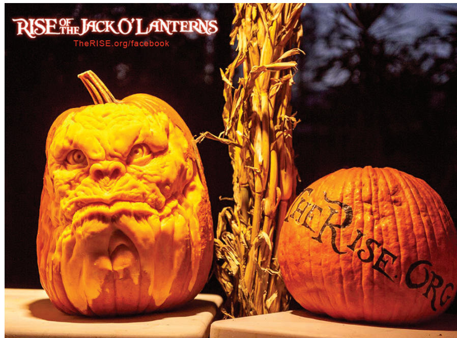
Go check out some pretty cool Jack-O-Lanterns in Old Westuury Gardens.

Pairings that are trending this season include Joyce Byers and the Alphabet Wall from "Stranger Things" and Disney Pixar's characters from "The Incredibles." Looking for more cheesy, but cute collaborations? Nacho Cheese Chips and Oreo Cookie costumes will fit the bill just right. Check out the website POPSUGAR and their list at "Halloween Costumes for Couples 2018" for more costume inspiration