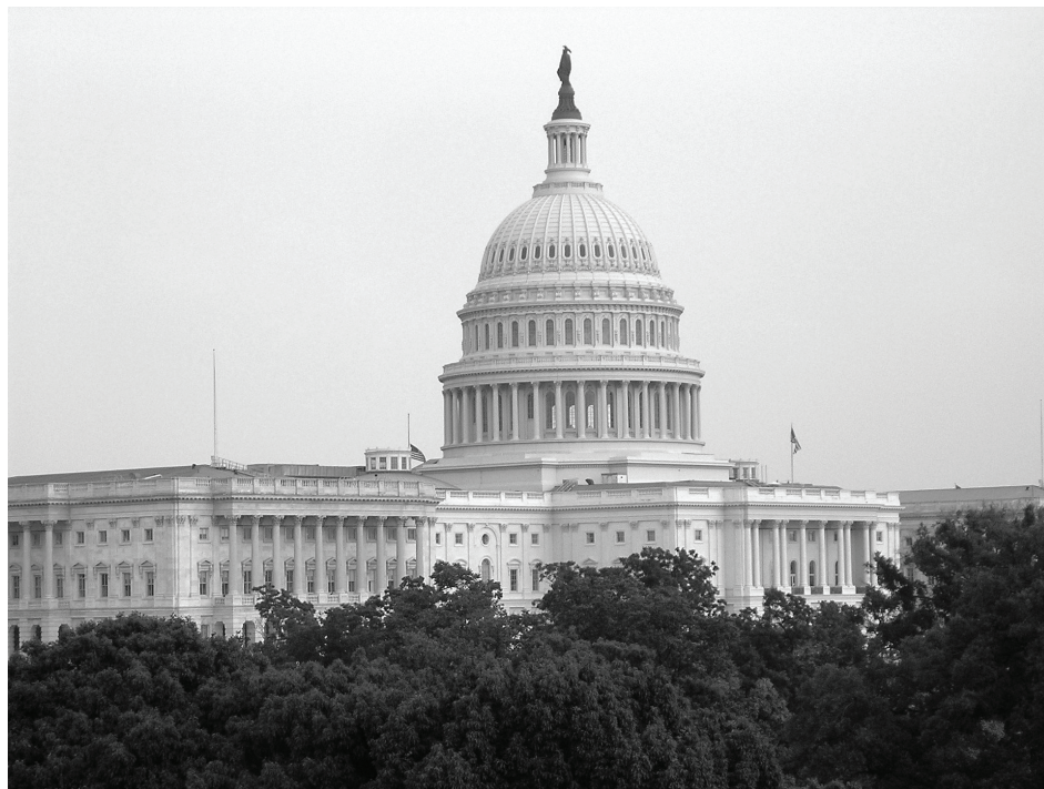
It may seem at times that your vote doesn't matter, but most of the institutions cited as "undemocratic" are often where democracy really makes its biggest impact.

Trump won Wisconsin, sure, but it was extremely close, and he only won it because many people who passionately supported him decided to vote and many who were lukewarm on Clinton decided not to. The average Wisconsinite Joe or Jane, therefore, played a detrimental role in deciding who would become the most