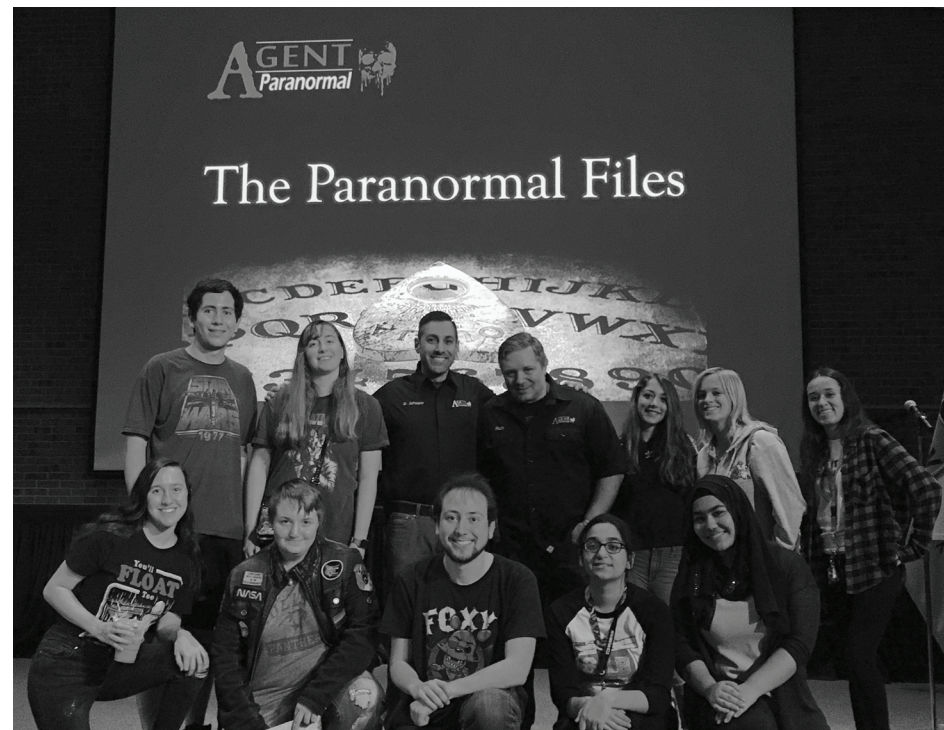
Students joined paranormal investigators around campus as they searched for paranormal activity at October 2 event.

DeProspero, Nikodem and their 18-person crew investigate any home or business having a paranormal problem: when "something unexplained" has happened or people believe there are demons among them. DeProspero said that 90 percent of these investigations have something to do with divination (Ouija boards, tarot cards or other type of supernatural summoning). Maybe this will make you think twice before using a Ouija board, as the investigators warned