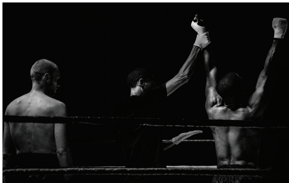
The moment when Khabib was declared the winner of the UFC fight.

This was similar to what happened with The Big Show and Rusev, two well-known WWE wrestlers, in a showing of Monday Night Raw in Sept. 29, 2014. Rusev was known as an anti-American Russian hero character that WWE had been playing around with for quite some