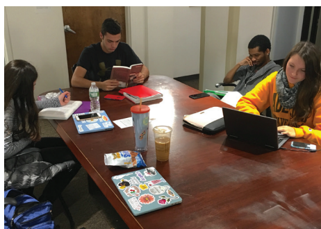
Students in the Honors College working hard studying for their midterms.

A few examples of self-care can be eating a healthy meal, going to the gym, taking a walk or getting the right amount of sleep.