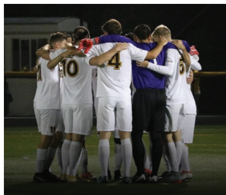
The Adelphi men's soccer team in a huddle before a game.

As the fall sports season is starting to wind down, the Panthers are looking to the postseason. See how each sports team has done so far this fall and stay updated with their playoff chances.