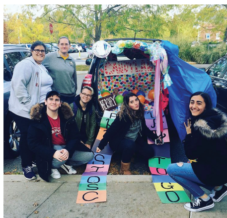
The Commuter Student Organization (CSO) is largely responsible for the establishment of this event at Adelphi, and placed second in the decorations contest.