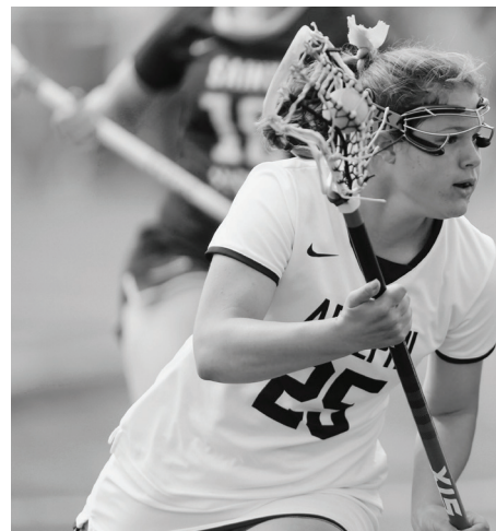
“Sports has and will always be my outlet and escape from life.”

Growing up, you both always told me it was okay to be different and that I will have trouble hearing in crowds and experience a lot of background noise. I did everything “normal kids” did, like playing on sport teams, including becoming a competitive swimmer, going to sleepaway camp and everything in between. (Thank