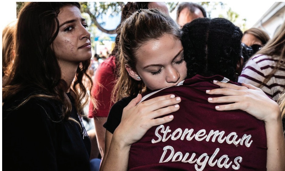
Shooting survivors mourn the loss of teachers and fellow classmates. Image from AP

"We practice our responses to emergencies. Our Department of Public Safety is trained and prepared. Our local first responders are in contact with us regularly," she said. "Our policy regarding weapons on campus is strict. Section 10 of the Student Code of Conduct prohibits use, storage or possession of any gun, even if the person has a license. That means no guns, anywhere on campus. We enforce this around the clock, but if a student