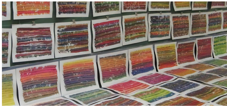
Pieces from the Kreyon Bondye Pa Gen Gonm exhibit in the UC in honor of Black History Month.