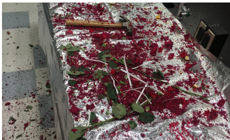
Aftermath of "Smashing Stereotypes"