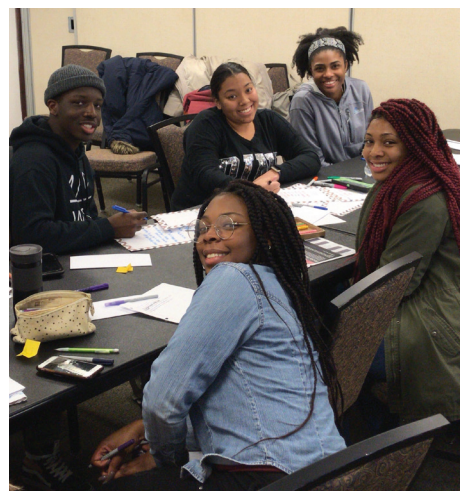
FOCUS members write self-love letters.