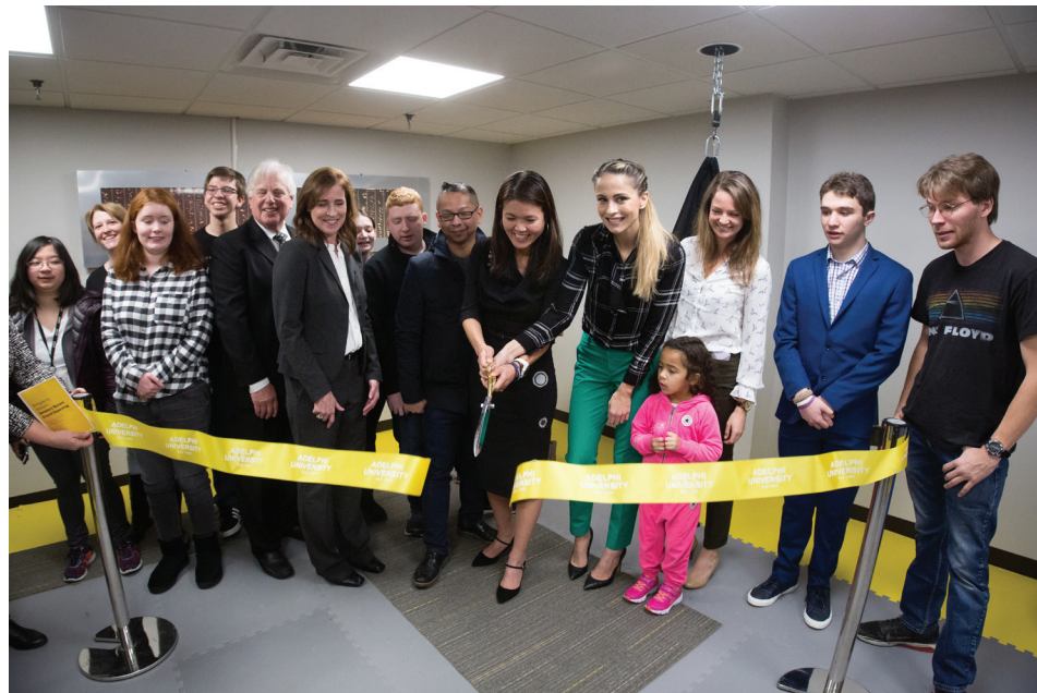
Faculty and students cut the ribbon to the newly unveiled sensory room.