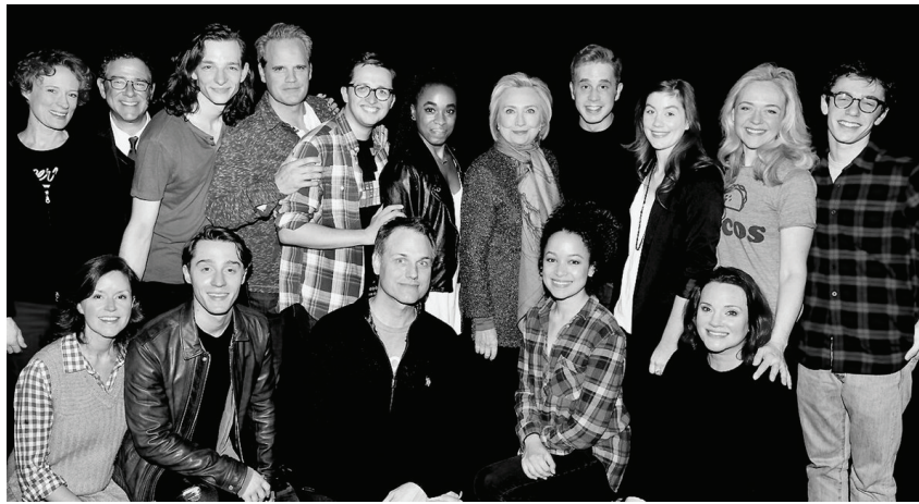
Hillary Clinton poses backstage with the cast of "Dear Evan Hansen."

But when Hillary Clinton went to see the show a few weeks ago, a situation that inspired me to write this article, she was given backstage access and all of the actors and actresses posed for pictures with her. Michael Park, Laura Dreyfuss and even Ben Platt, who played the lead in the show, took to social media almost instantly, showering Clinton with praise for her mere presence and describing her as the true American president. The show's