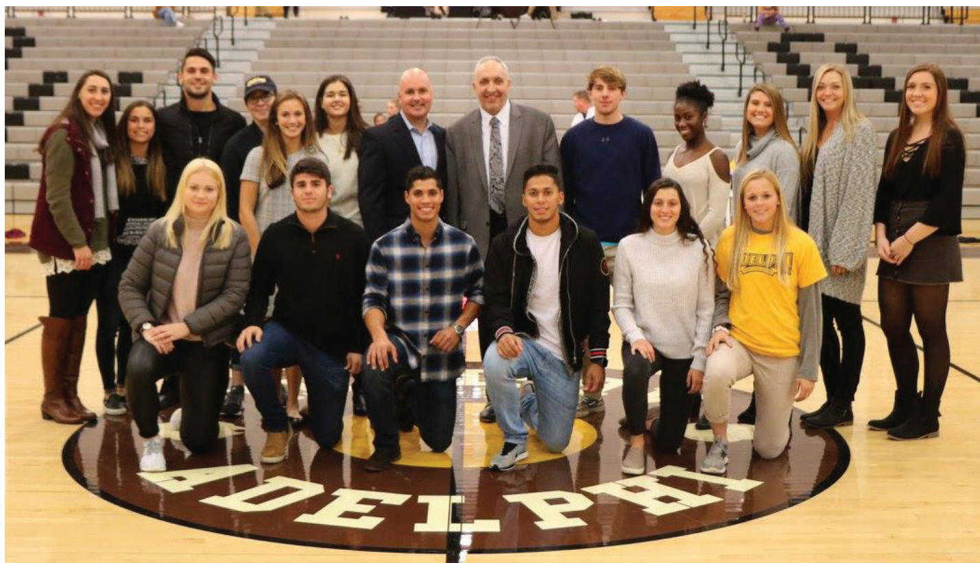
Adelphi student athletes were recognized last month for being Legacy Advisor Player of the Week.