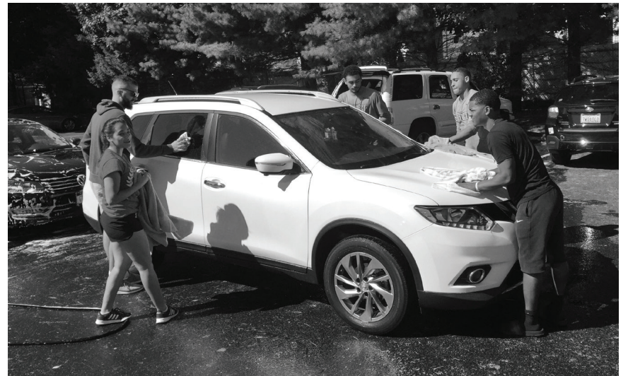
The men’s basketball team held a car wash to give back to the community.