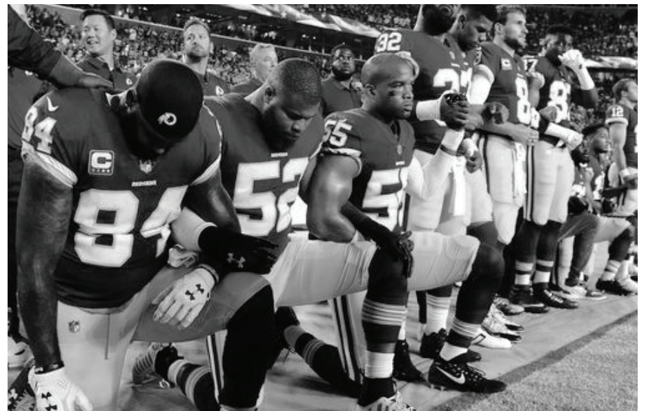
The Washington Redskins protested during the national anthem at a recent game.

Even though the opinions differ and the message has been blurred, our right of free speech still allows us to act in ways that we see as necessary. The line between exercising one's right to free speech and disrespecting the country remains a thin border.