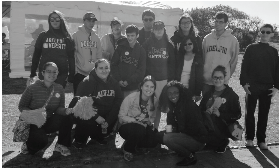
Adelphi students participate in the Walk for Autism at Jones Beach.

Learn more about Autism Speaks at www.autismspeaks.org .