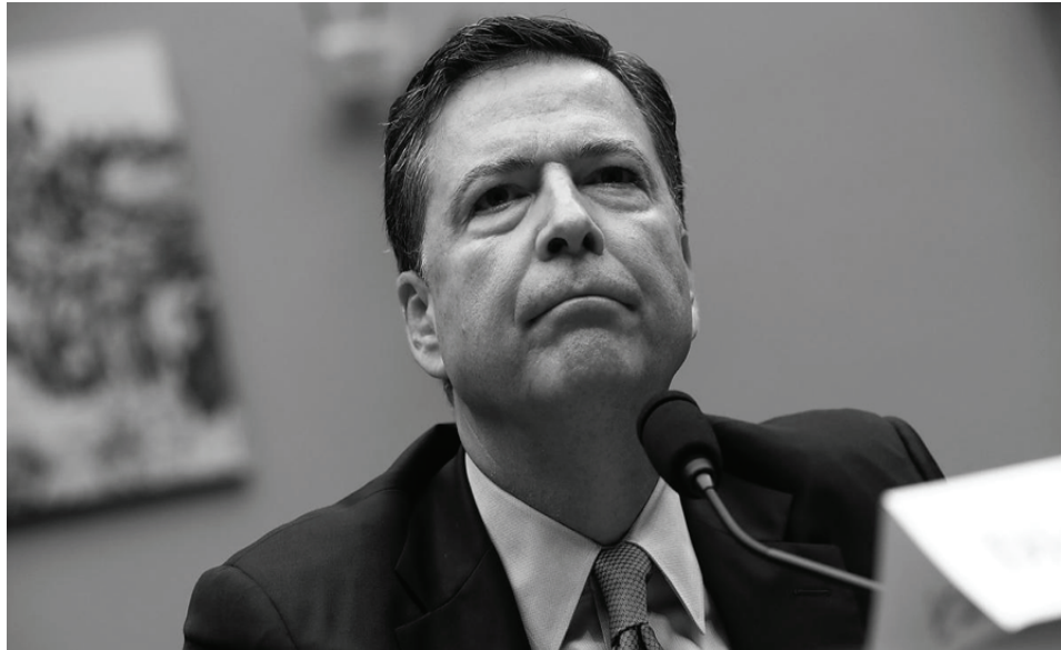
FBI Director James Comey testified earlier this month that there is an investigation into President Trump’s ties to Russia.

White House Press Secretary Sean Spicer continued to baffle reporters and infuriate those who value intelligent thought by stating, “There’s an assumption that just because there’s an investigation, that it would have to be about something.” In regards to these collusion charges, this statement seems simply ridiculous when factoring in the mounting evidence that supports the allegations in