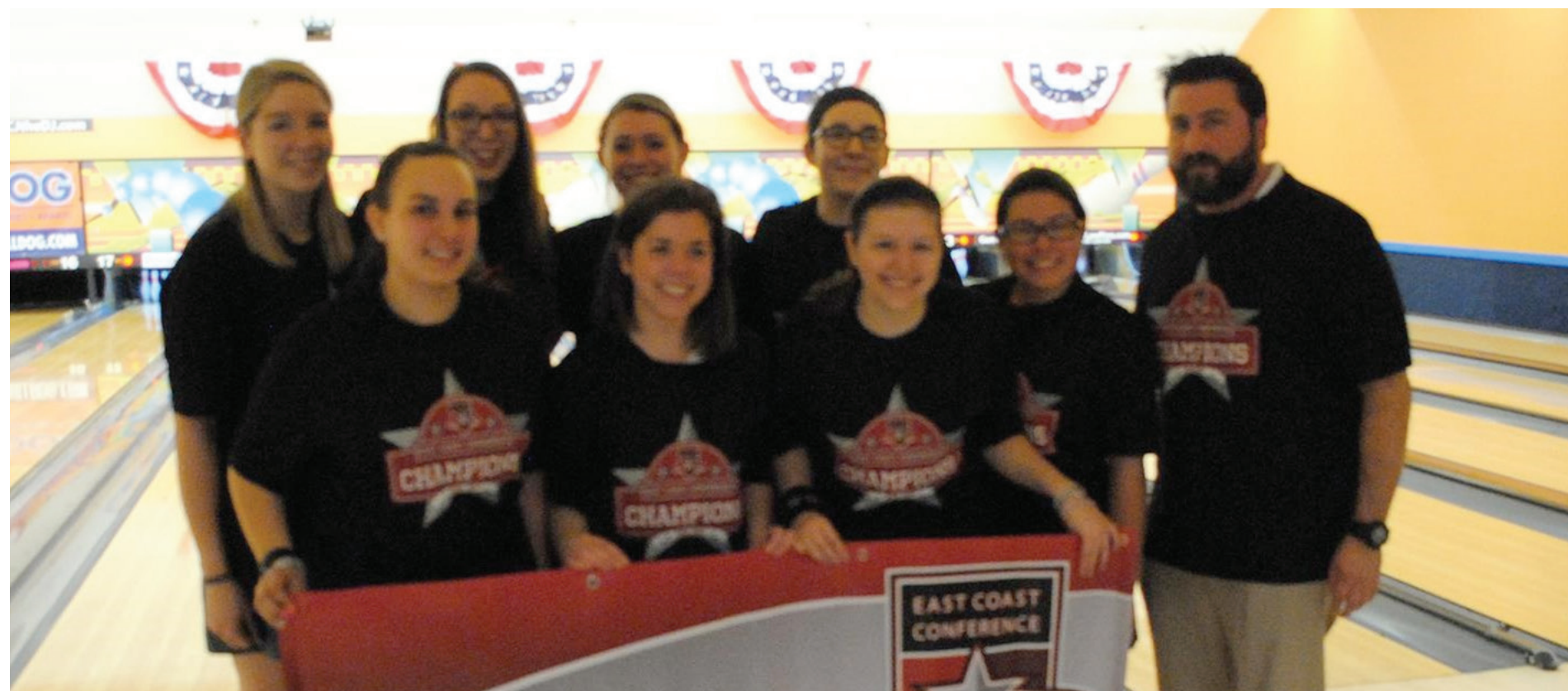
The Adelphi Women's Bowling team retained their title as East Coast Conference Championships after winning the inaugural distinction during the spring of 2016. They defeated Lincoln Memorial University on March 26 in Keene, NH, en route to securing their victory and bringing back the ECC crown. The team looks forward to next year and lucky number three.