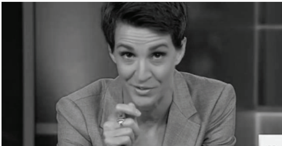
MSNBC’s Rachel Maddow made news of her own recently when she said she had Donald Trump’s tax return.