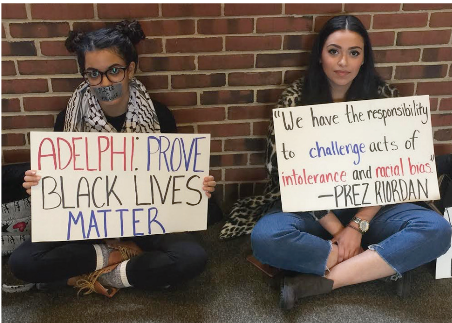
The ILS staged a silent demonstration in the UC that coincided with the release of their second letter to the administration and overarching Adelphi community explaining their motives. You can read the letter at: https://www.facebook.com/innerlightsociety.

Focus Is DACA and LGBTQIA+ Students and Improved Communication