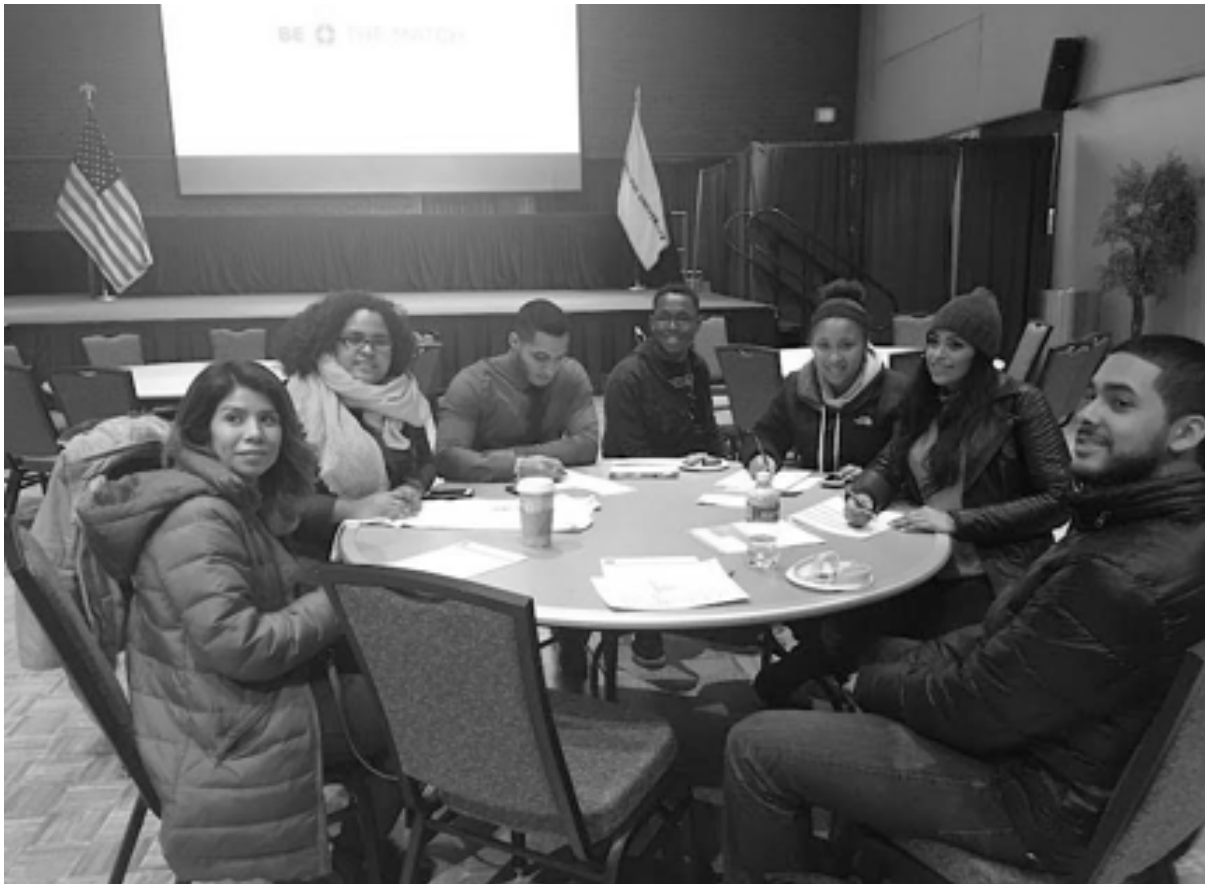
Students fill out applications before getting tested.