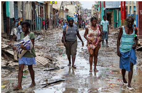
Aftermath of Hurricane Matthew