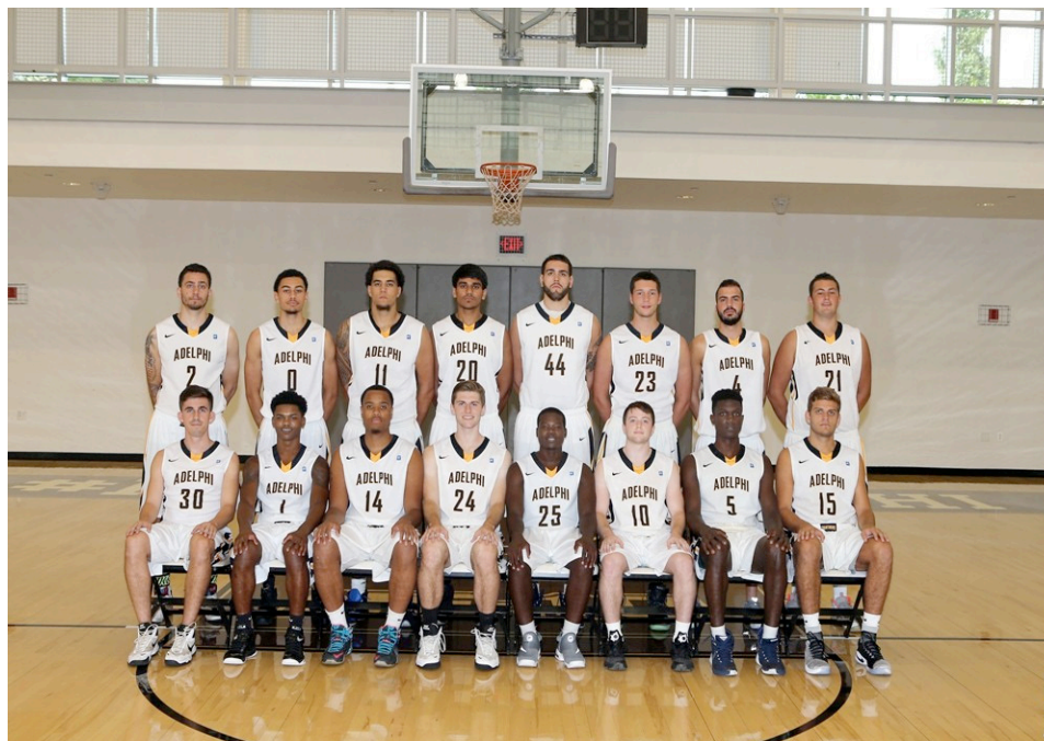
2016-2017 AU Men's Basketball Team