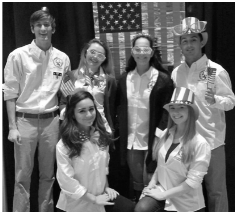
Members of the Executive Board of Adelphi’s Student Government Association participated in the planning of the election night party.

For many at the party, the outcome of the election was one that was highly unexpected. However, the students said that just as the election night party served as a safe space for them to express themselves.