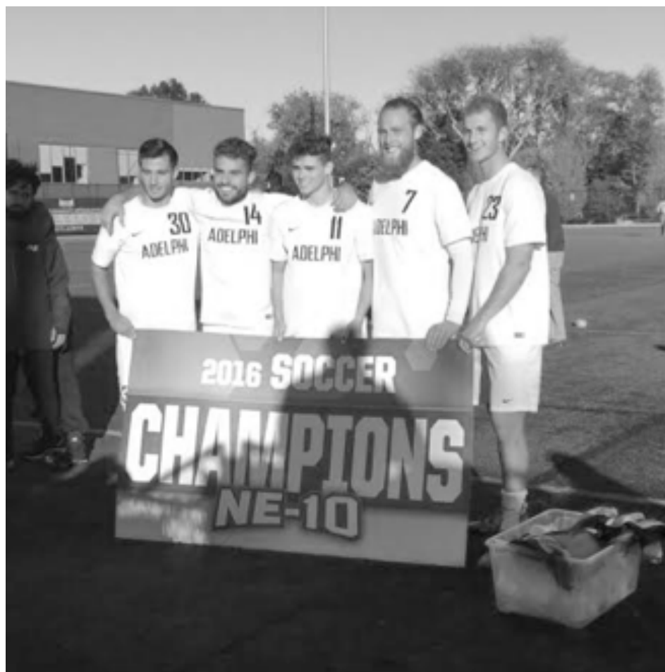
Members of the Men's Soccer team celebrating their victory.