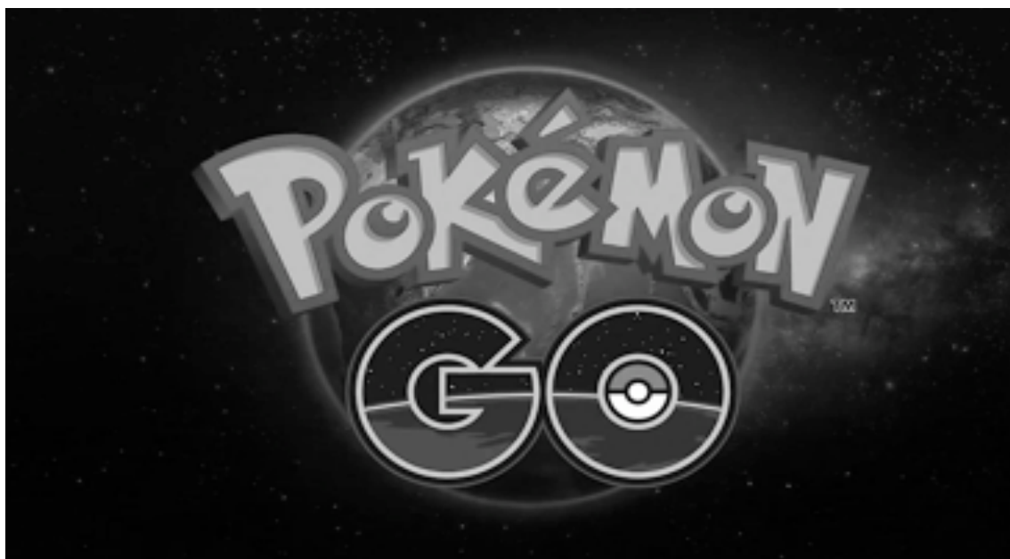
Pokemon Go's success has not come without cost.