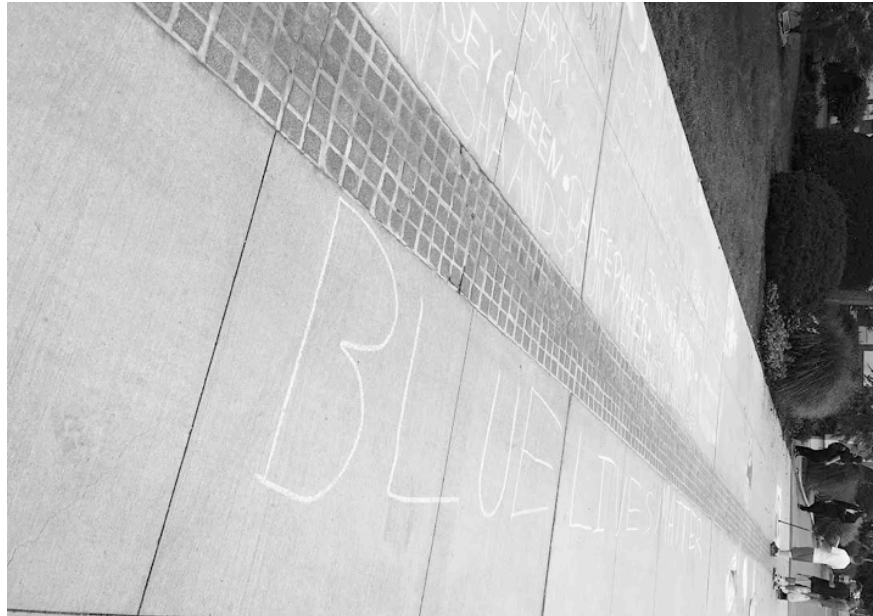
The site of Black Students United's Chalk Up piece.

Lake stressed to them that she didn't want them to feel like she was trying to prevent them from expressing their