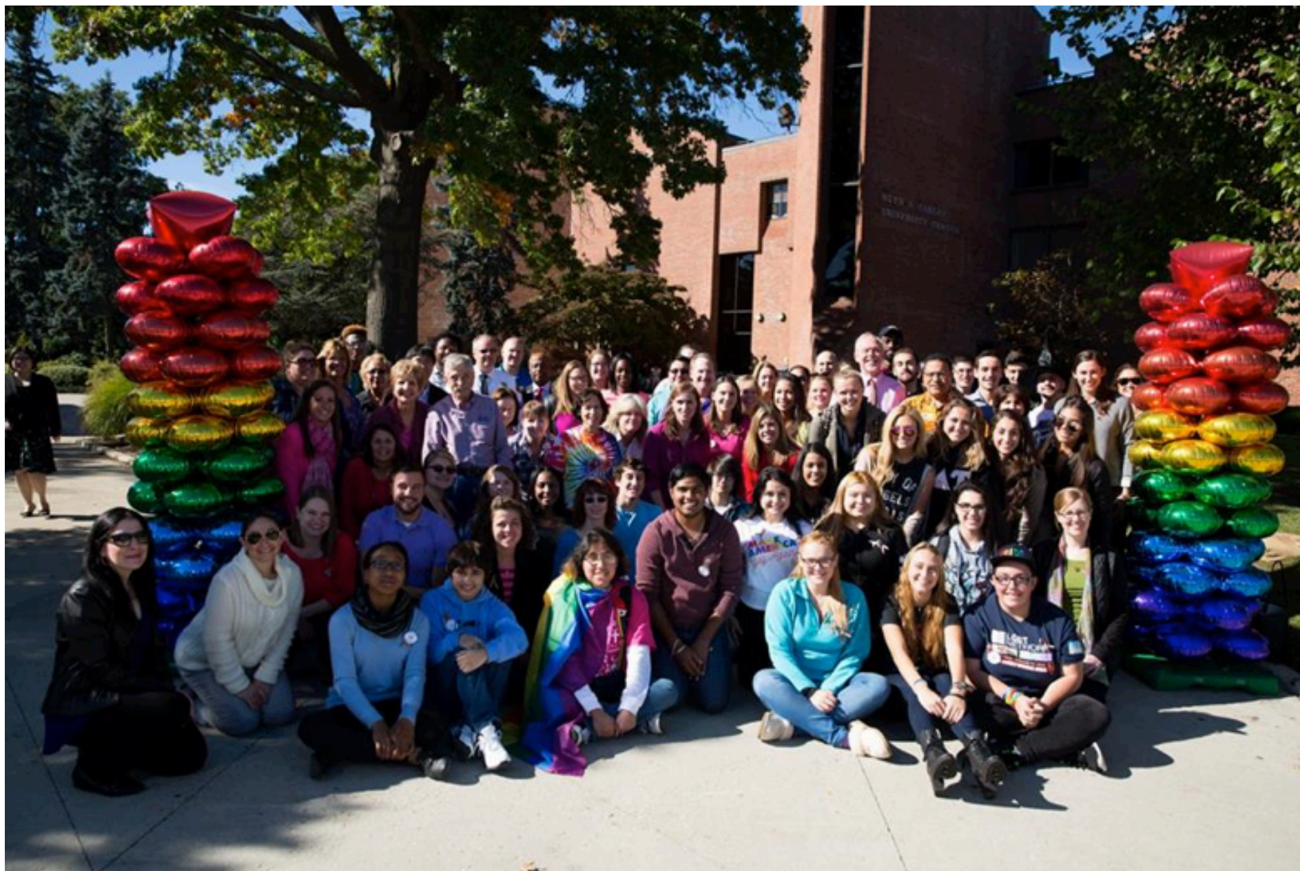
Students, faculty, professors and administrators gathered for the LGBTQIA+ Support Picture in front of the University Center.

Photo provided by Center for Student Involvement