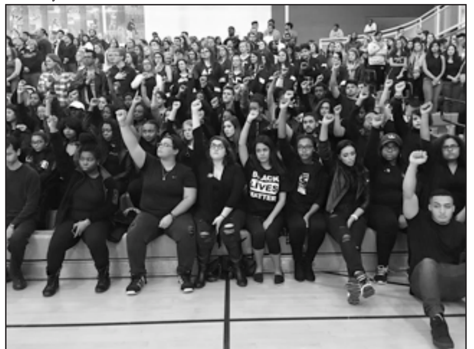
A group of students participated in a Black Lives Matter demonstration, emulating the protest of quarterback, Colin Kaepernick, during the National Anthem at Midnight Madness. There was mixed reaction, including hostile social media backlash following the game.

"It's not until people hear each other and see why they feel they way they do, we're never going to get past the wall that's been up between these groups. It'll continue to be an escalation of anger, frustration and fact-free debate, that doesn't serve anything but to harden the resolve of both sides," Lake stated. "Interactions can lead to clarifications of misunderstandings and provide a way to move forward and change the dialogue."