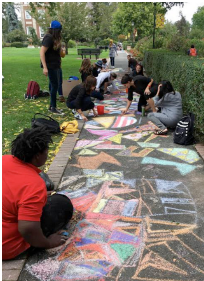
2D students filling the path with nodes and vectors.