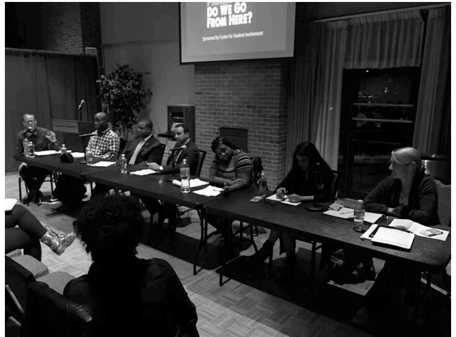
Participants talk as they try to figure out the important question where to go from here.