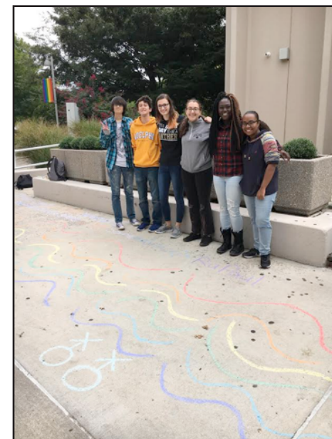
The GSA's piece

Although due to rain, the chalk designs did not last longer than the day, collectively, the drawings represented the true identity of Adelphi students. They visually showcased Adelphi's diversity, while also emphasizing that the students are united by the common goal of making a difference in the world. The striking illustrations confirmed the talent and passion of Adelphi students, and in return, made this year's Chalk UP! another success.