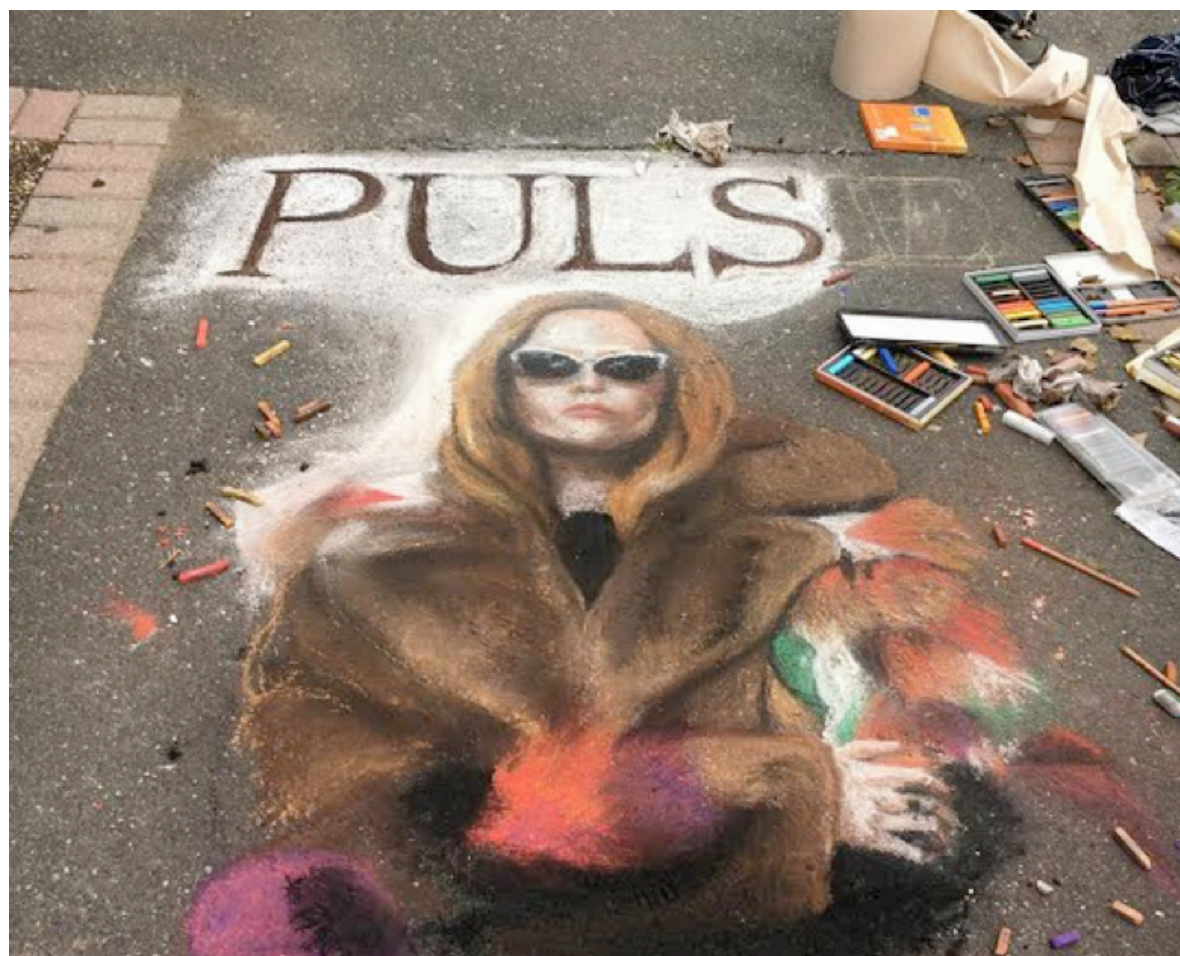
The cover of Pulse filling the traditional magazine location with the help of students and alumni.