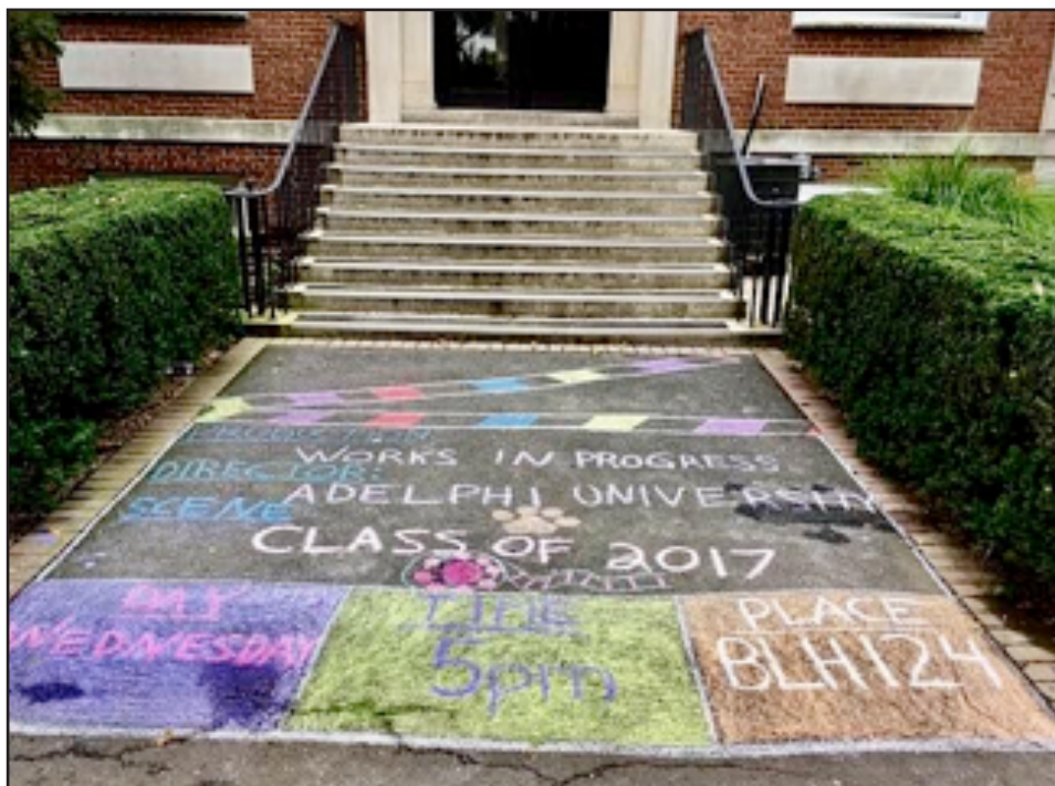
Adelphi students took to the walkways of campus and brought a lot of color.

With over 80 campus-based clubs and organizations, the event is a way