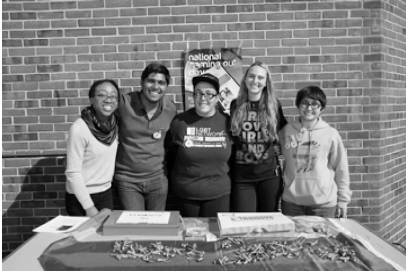
GSA students raise money for the Trinity Place Shelter.