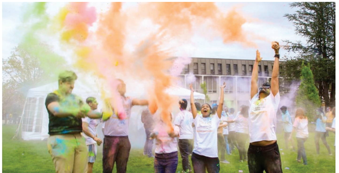
Let the colors of the Holi Festival spread the message of peace and happiness.

Last year, since it was the first time the festival was being celebrated on campus, the executive board was not sure