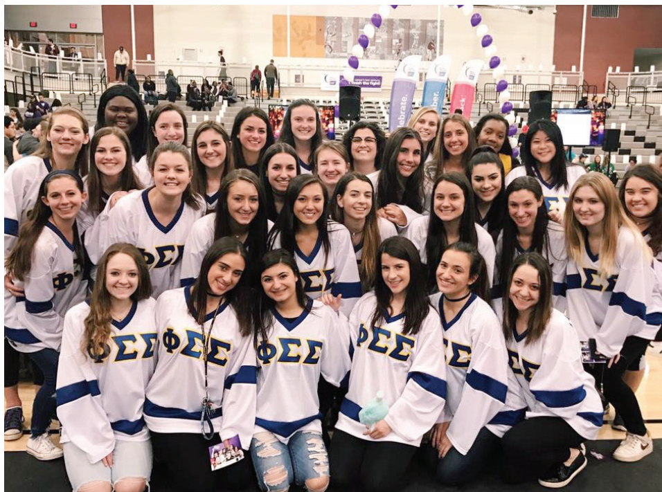
Phi Sigma Sigma Sorority turned up in full force for Relay for Life on April 7 in the CRS.

During the night, the chairs of the event spoke about their personal ex-