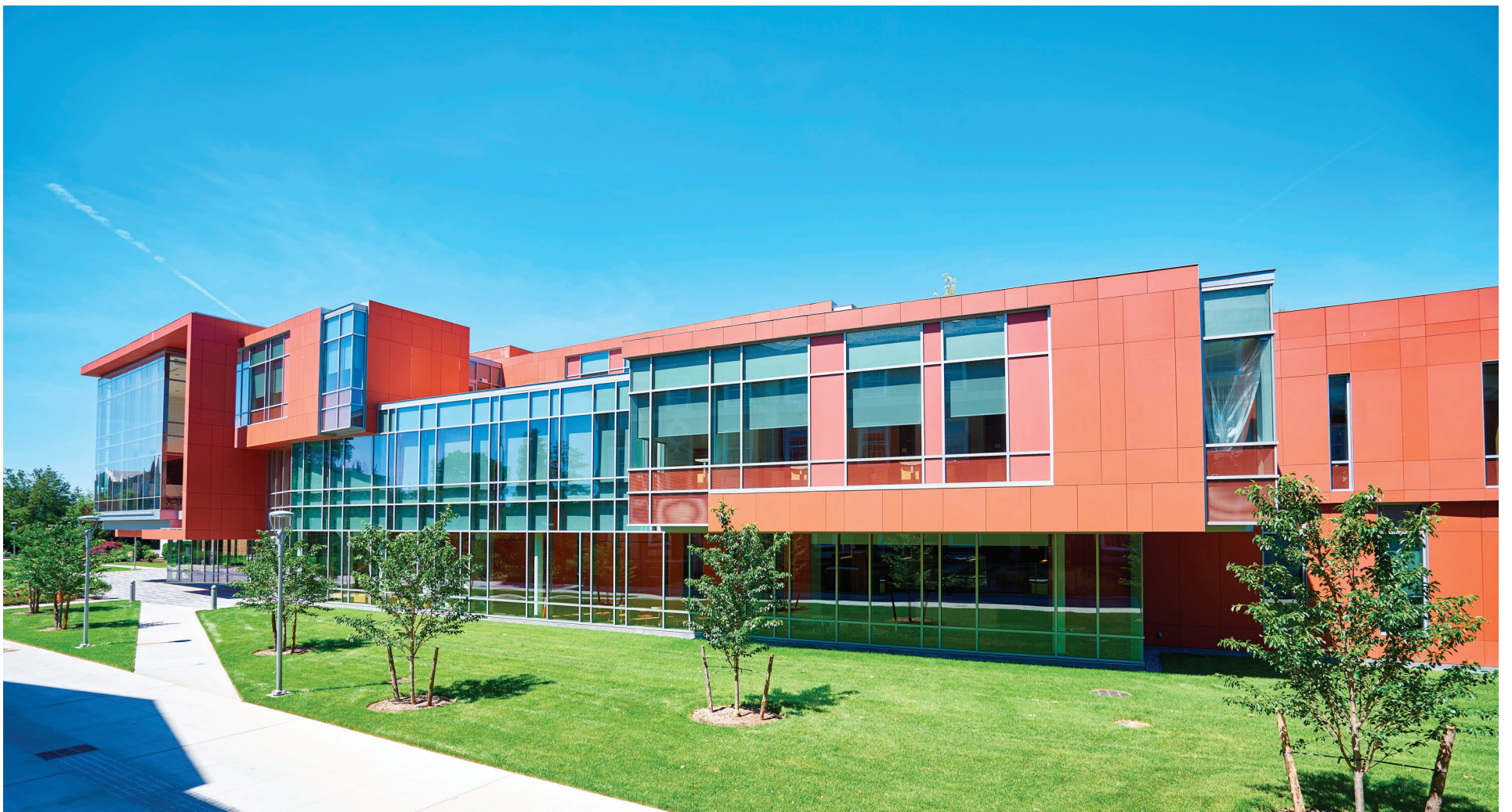
Adelphi's new Nexus Building on South Avenue