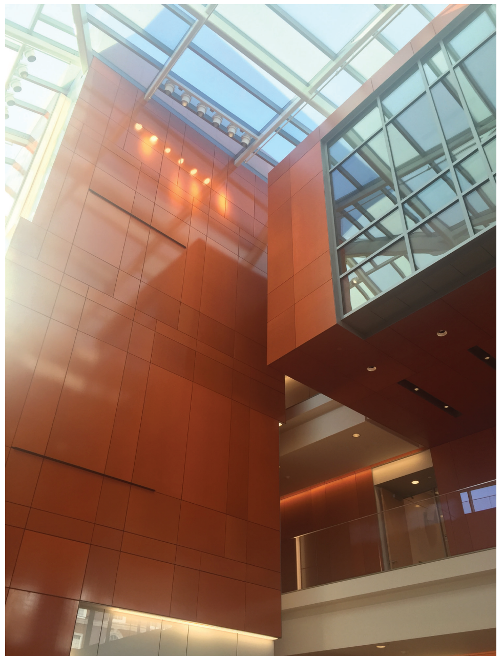
Interior of the Nexus Building

Steelman added that the transparent design creates a strong visual link through the Nexus Building and the surrounding intimate garden space to bind them together as one. "The focus of all of the internal energy is concentrated on the corner overlooking the main campus quad where the special presentation room levitates over the campus as a symbolic expression of Adelphi University's open, inviting and engaging character as well as the institution's lofty aspirations."