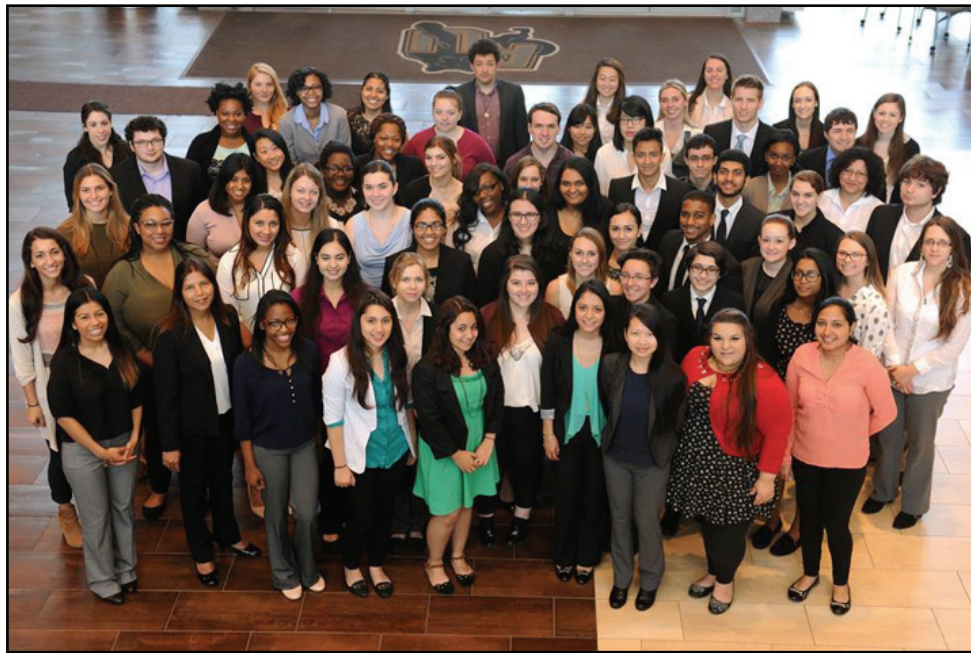
Students of the Community Fellows Program

did help me develop in both ways. I worked as a public relations and development intern and gained knowledge of injustices faced by farm workers, such as how they are excluded from basic labor rights. This experience helped me develop personally because I became passionate about fighting for justice and was able to meet farm workers and advocates. Professionally, I took on tasks that were new to me and came back with several new skills that I will apply to my work in the future.