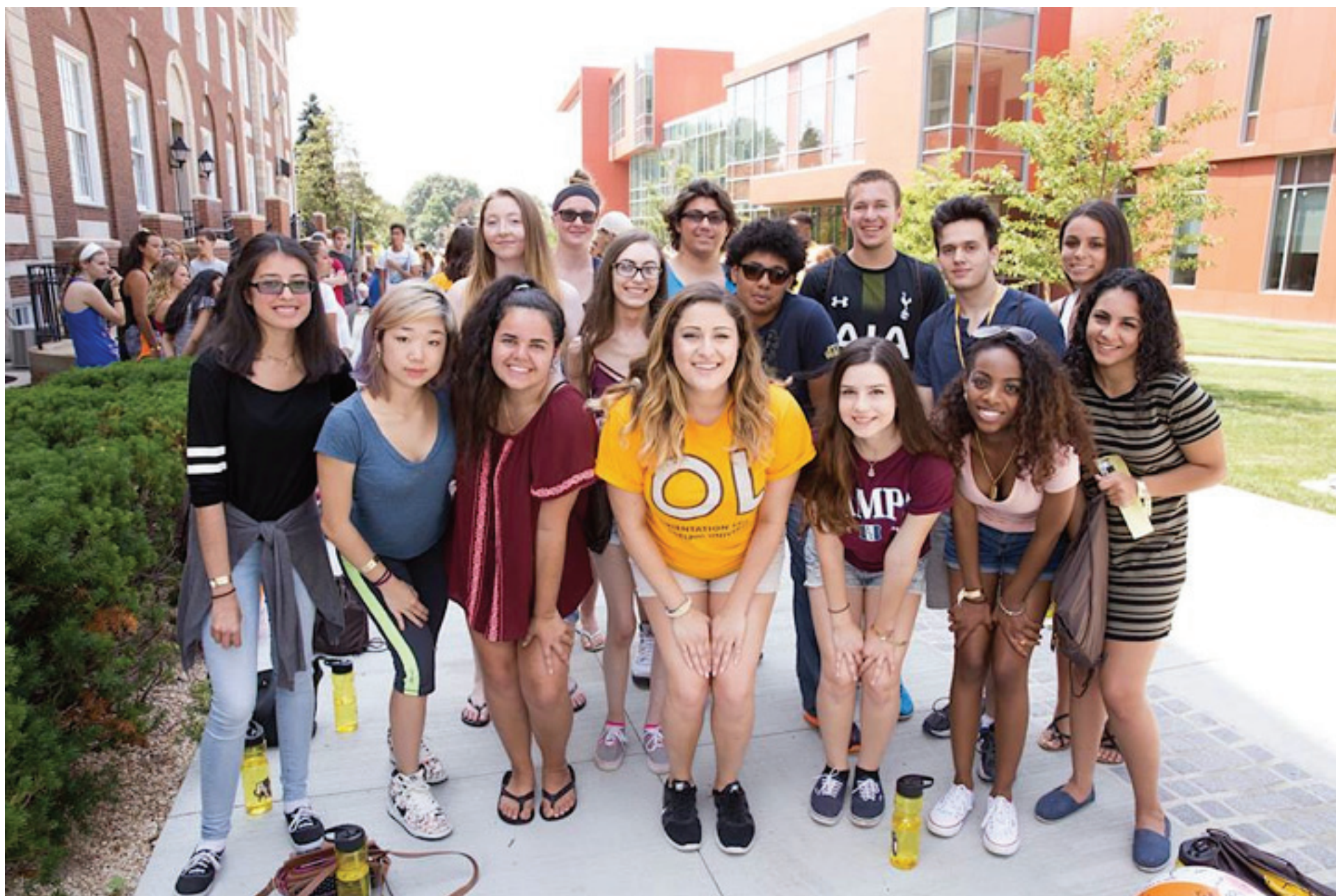
Freshmen pose at Orientation 2016.