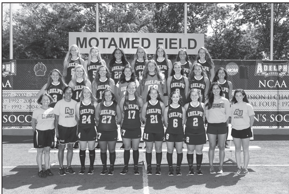
WOMEN'S FIELD HOCKEY

The Panthers are ranked number one in the NCAA East Region rankings. The team recently returned from Florida where they participated in the NOVA Southeastern tournament. Matched up against tough competition, the team won their first game 3-1 and then lost their next three, 1-3, 0-3, 2-3. The team will travel to Pennsylvania today to compete in the California (PA.) Tournament.