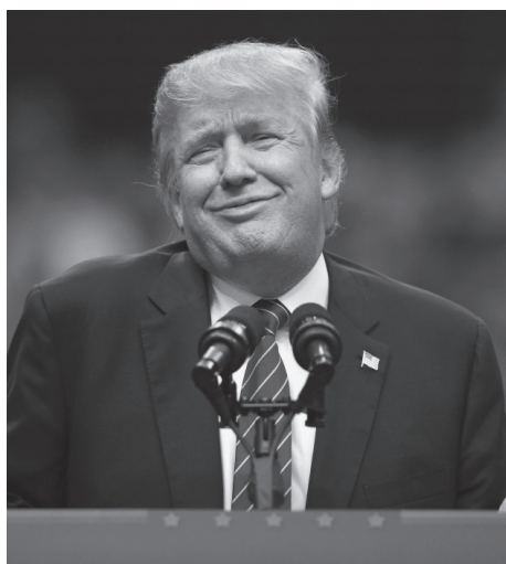
Presidential nominee Donald Trump

Donald Trump represents the deepest possible perversion of the American dream. He stands as a figurehead for all the rancid, filthy ideals that have corrupted our people into believing that salvation lies in a dollar and that confidence can be bought and sold at the price of intelligence and decency. He is a gold-plated symbol of shallow dreams and a puny excuse of a man. He lacks the total capacity for conviction and has become, in this campaign, a totally preposterous caricature of himself and everything he claims to represent and speak for.