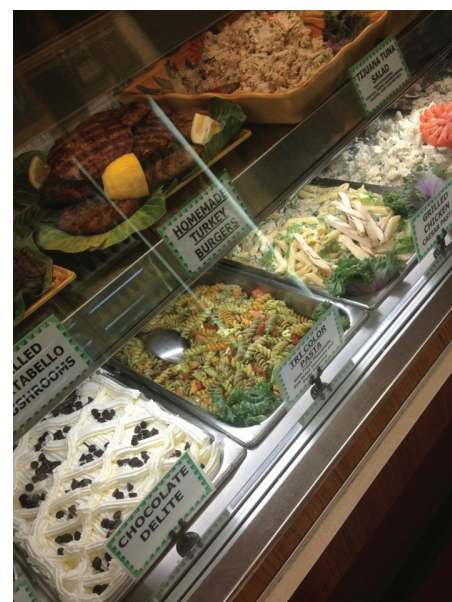
Storefront and food displays of the Adelphi Delicatessen.