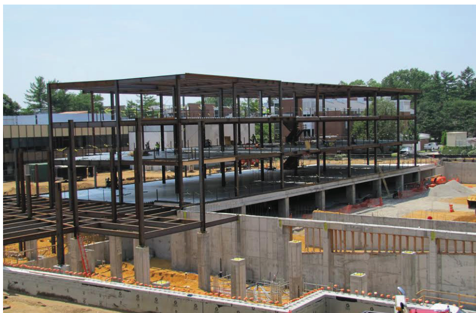
Photo of the new archaeological site on Adelphi's campus.

Regardless of the costs and the risks, Adelphi is assured that the university is pulling together its departments and resources to ensure that the deconstruction of the Nexus Building is timely. Not only does Adelphi hope the space will be cleared by August 2016 in time for classes, we also expect to avoid most of any curses that would typically come from disturbing an ancient underground burial site. Until then, the staff here at The Delphian encourages everyone to hang in there, finish their spring semester strong, and make the best of any unfortunate supernatural occurrences that might happen in the near future.