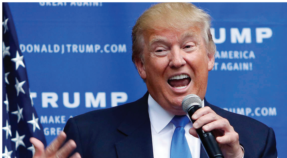
Trump unveils his new plan and rises in the polls.

“Why waste money on fancy advertisements or events when you can just give it directly to the people?”