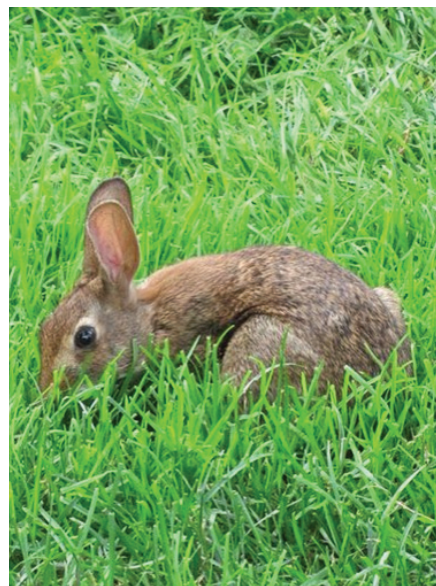
Not as innocent as they may appear.

2. If at all possible, limit the time you are in class and proceed from building to building in a timely, orderly fashion. Should you cross an aggressor