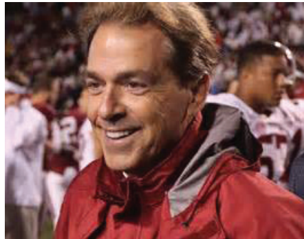
Nick Saban, future coach of the Adelphi University football team.

Adelphi has a long history of excellence in athletics and the addition of the football team is expected to carry on that tradition.