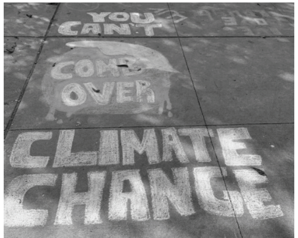
Students were able to participate in Chalk Up during the week leading up to Spirit Weekend.

Notably, music students and immersive theater students collaborated on a pop-up performance. It is the collaborative aspect of art that inspired the festival in the first place. Originally, the "Fall Arts Festival" was not this event's name. It started back in 2013 as Ephemeral, a campus-wide exhibition