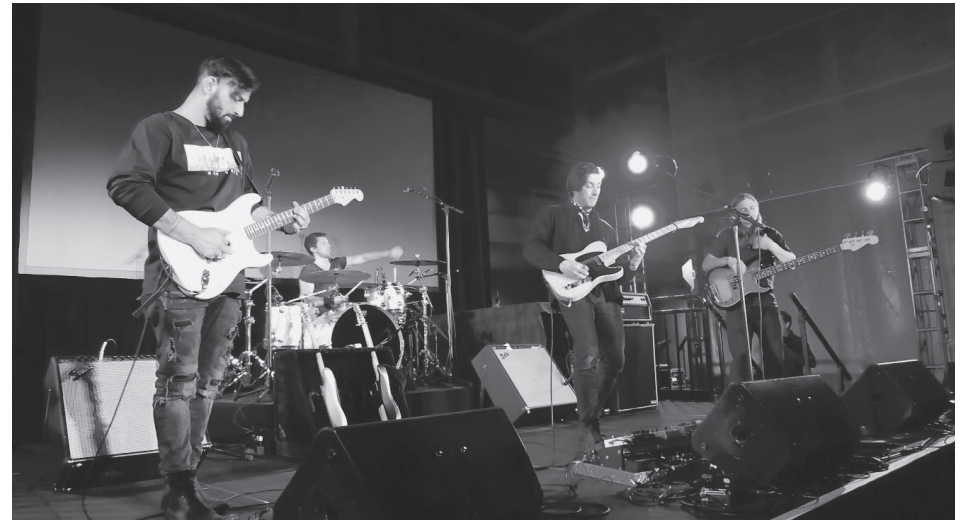
Local band Oak & Ash performing at SAB's first Panther Variety Show during Spirit Weekend.

Similar to the Oak & Ash performance, there was an enthusiastic gathering around the stage with a few stragglers who remained on their phones. However, during gnash's performance, he interacted with the audience by encouraging them to bounce, clap and sing lyrics from his songs. Also, many students