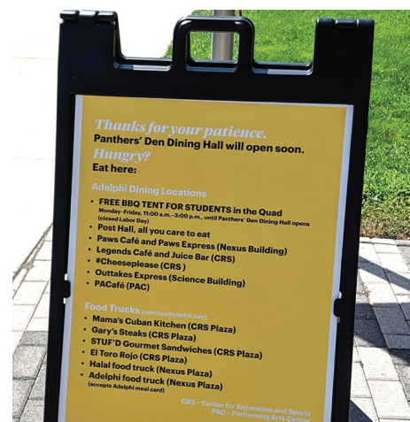
"Thanks For Your Patience" dining signs read directing frustrated students where to eat.

In signing the petition, students request that their needs be addressed by "providing refunds on Adelphi University meal plans, allowing students to reduce or eliminate their student meal plan, and supporting students with satisfying, healthy meals."