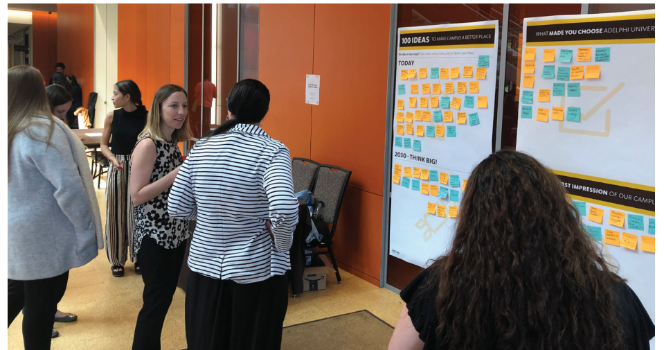
Architects and strategists getting insight from students at the Master Plan table in the Nexus Building on September 19.

This study of the campus is very timely as the renovation of the University Center is underway. This semester, the Adelphi community had to adapt to the University Center being out of commission and using the new Panther's Den dining facility located between Levermore Hall and Blodgett Hall. The Panther's Den was not in full use until Monday, September 23 even though it was originally going to be ready for the first day of classes. Therefore, the master plan also received a lot of suggestions for more food options, healthier choices and improvements in the meal plan.