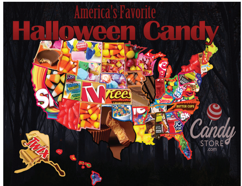
Candystore.com's map of the United States highlights our favorite candies by state. In New York, you may be surprised to learn, it's Hot Tamales.

The NRF added that when it comes to pet costume popularity, "it's nearly two in 10 (17 percent). Spending on pet costumes continues to increase: This year total planned spending for pet costumes comes in at $490 million." This statistic is impressive but fitting; a dressed-up pet is sure to steal hearts (and rack in likes and comments on Facebook or Instagram).