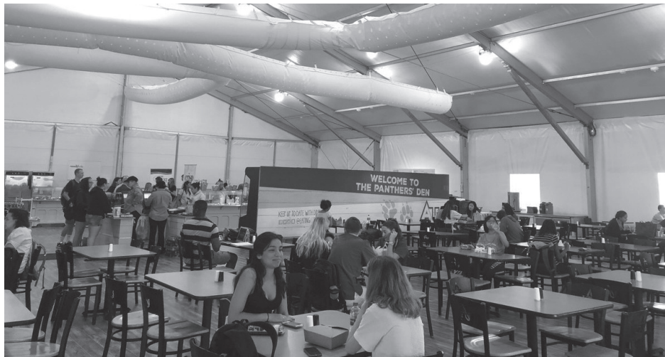
Inside view of the Panther's Den temporary dining hall. @AdelphiUMedia on Twitter

The Den also features a "Your Choice" section, offering a varying selection of hot proteins, vegetables and sides. According to Adelphi's website, as